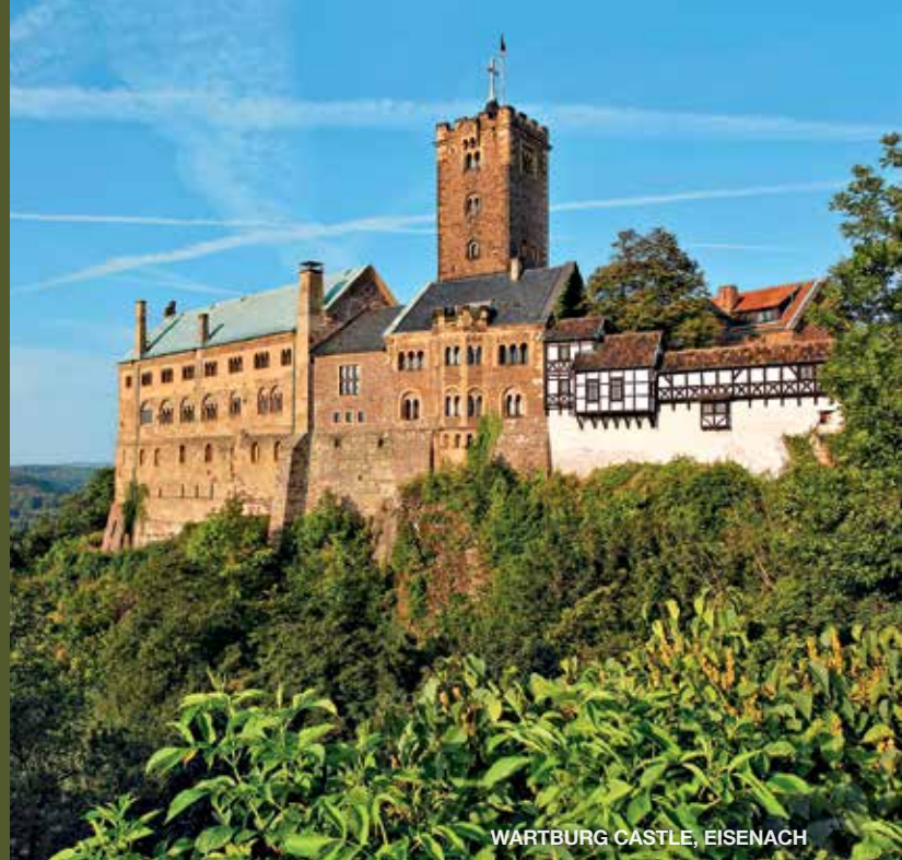
WARTBURG CASTLE, EISENACH

■ MyGLOBUS Personalize your tour ahead of time with additional excursions. Visit our website for details and conditions.