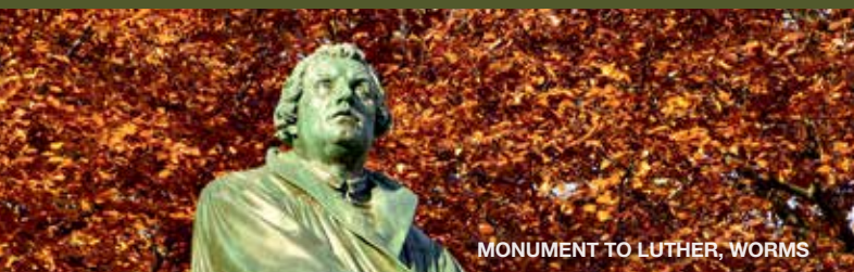
MONUMENT TO LUTHER, WORMS

Journey to Eisenach and meet your Local Guide. Visit LUTHER HOUSE, ST. GEORGE'S CHURCH, where Luther was a choir boy and