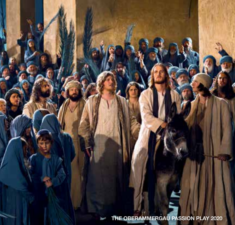
THE OBERAMMERGAU PASSION PLAY 2020