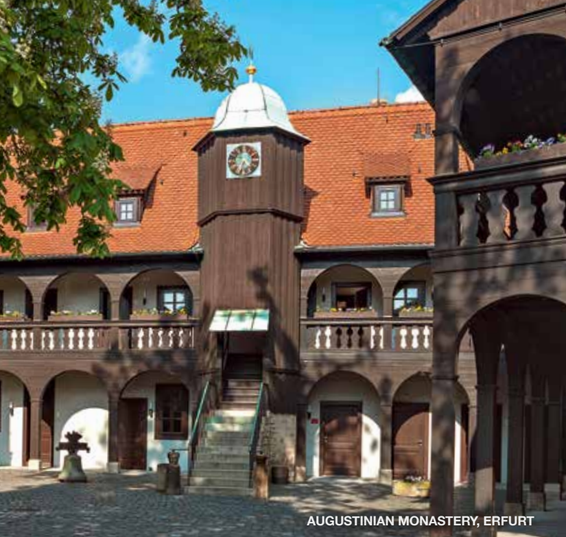
AUGUSTINIAN MONASTERY, ERFURT